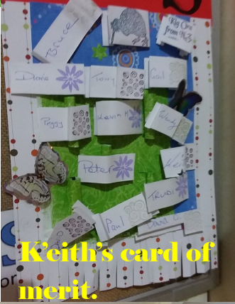
Keith's card of merit.