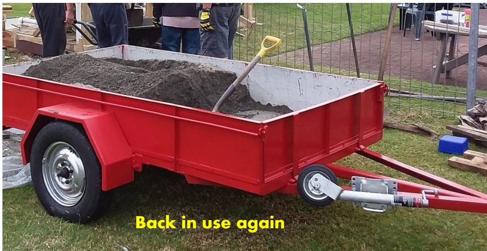
Back in use again