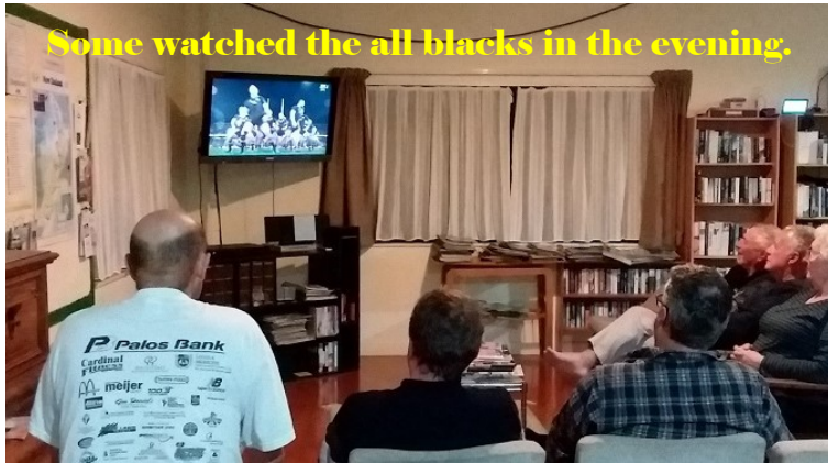
Some watched the all blacks in the evening.

Most weekends there will be a group staying over for a relaxing break and on this occasion there was a robust sequence of pool and darts games combined with other happenings such as tree planting, a card making class, and music interludes. The spa was again a hot favourite as were a few rounds of five crowns and the Saturday night Chinese meal was just perfect - topped off with the winning after dinner serve the all blacks dished up to our Aussie friends. The option of an evening by the fire also has appeal. It is becoming a rather pleasant habit spending frequent weekends with friends at WOS - doing nothing in particular and at a pretty easy pace as well.