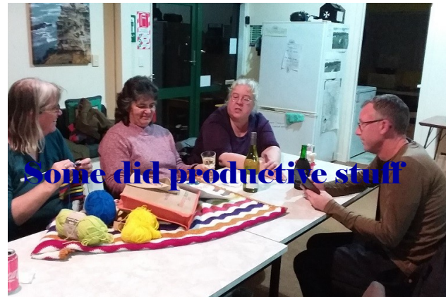
Some did productive stuff