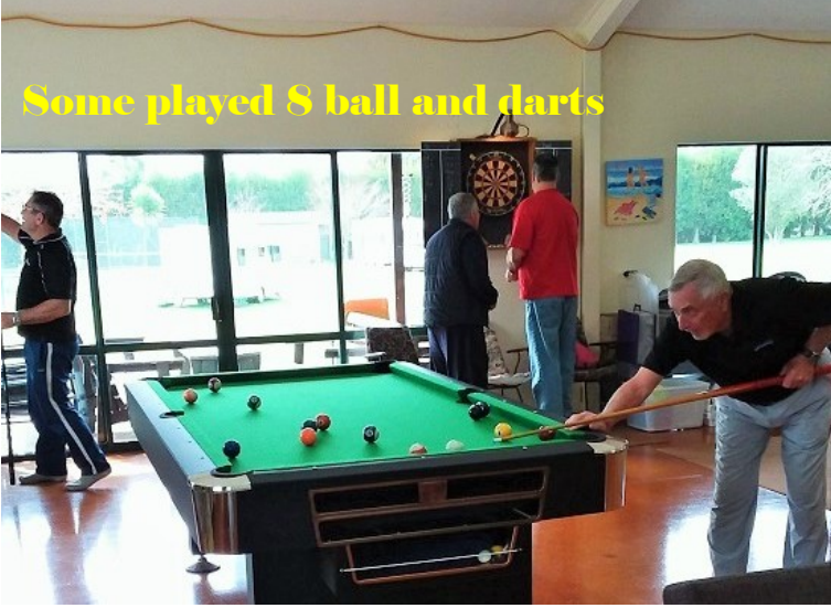
Some played 8 ball and darts

Most weekends there will be a group staying over for a relaxing break and on this occasion there was a robust sequence of pool and darts games combined with other happenings such as tree planting, a card making class, and music interludes. The spa was again a hot favourite as were a few rounds of five crowns and the Saturday night Chinese meal was just perfect - topped off with the winning after dinner serve the all blacks dished up to our Aussie friends. The option of an evening by the fire also has appeal. It is becoming a rather pleasant habit spending frequent weekends with friends at WOS - doing nothing in particular and at a pretty easy pace as well.